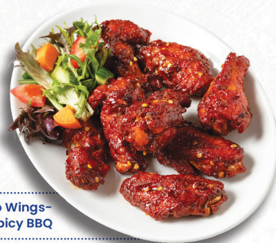
K'man Doo Wings- Spicy BBQ