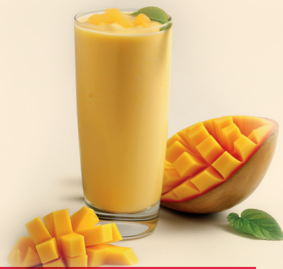
Nepali Mango Lassi (Yoghurt, Mango smoothie) $8.00